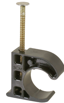
556-2 Patent # 7,207,530