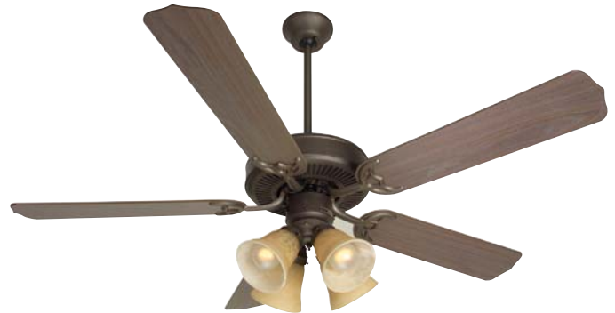
European Bronze CD Unipack with 52" Contractor's Design Washed Walnut Birch Blades and Matching Light Kit

Model-Finish CDU2040B Blade-Finish BCD52-OB Light-Finish Included