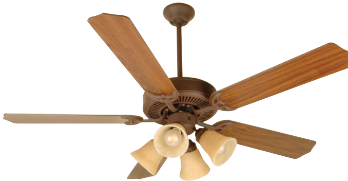
Rustic Iron CD Unipack with 52" Contractor's Design Walnut Blades and Matching Light Kit

Model-Finish CDU204EB Blade-Finish BCD52-WWB Light-Finish Included