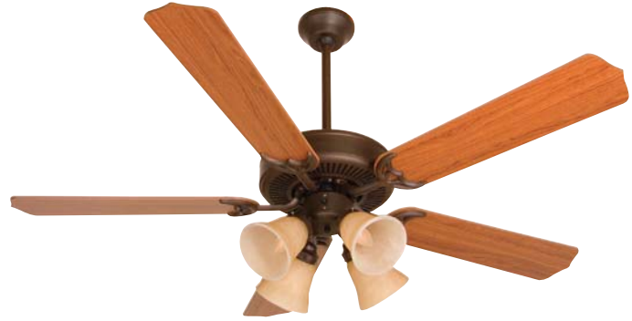
Aged Bronze CD Unipack with 52" Contractor's Design Cherry Blades and Matching Light Kit

Model-Finish CDU204RI Blade-Finish BCD52-WB6 Light-Finish Included