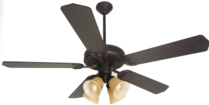
Oiled Bronze CD Unipack with 52" Contractor's Design Oiled Bronze Blades and Matching Light Kit

Model-Finish CDU2040B Blade-Finish BCD52-OB Light-Finish Included