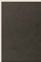
EB European Bronze