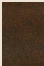
AG Aged Bronze