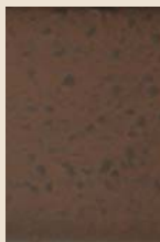
OB Oiled Bronze