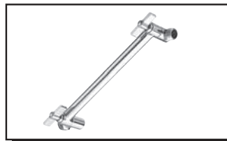
D481150 - 9" adjustable high flow shower arm

Danze products are covered by a manufacturer's limited "lifetime" warranty for manufacturing defects.