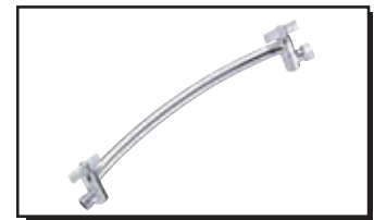
D481170 - 13" adjustable curved high flow shower arm