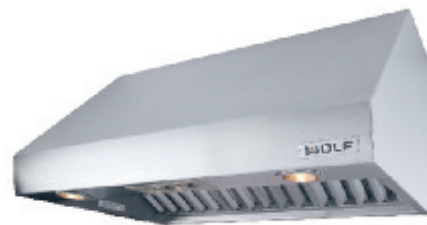
Model PW422418 Pro Wall Hood

Accessories are available through your authorized Wolf dealer. For local dealer information, visit the find a showroom section of our website, wolfappliance.com .