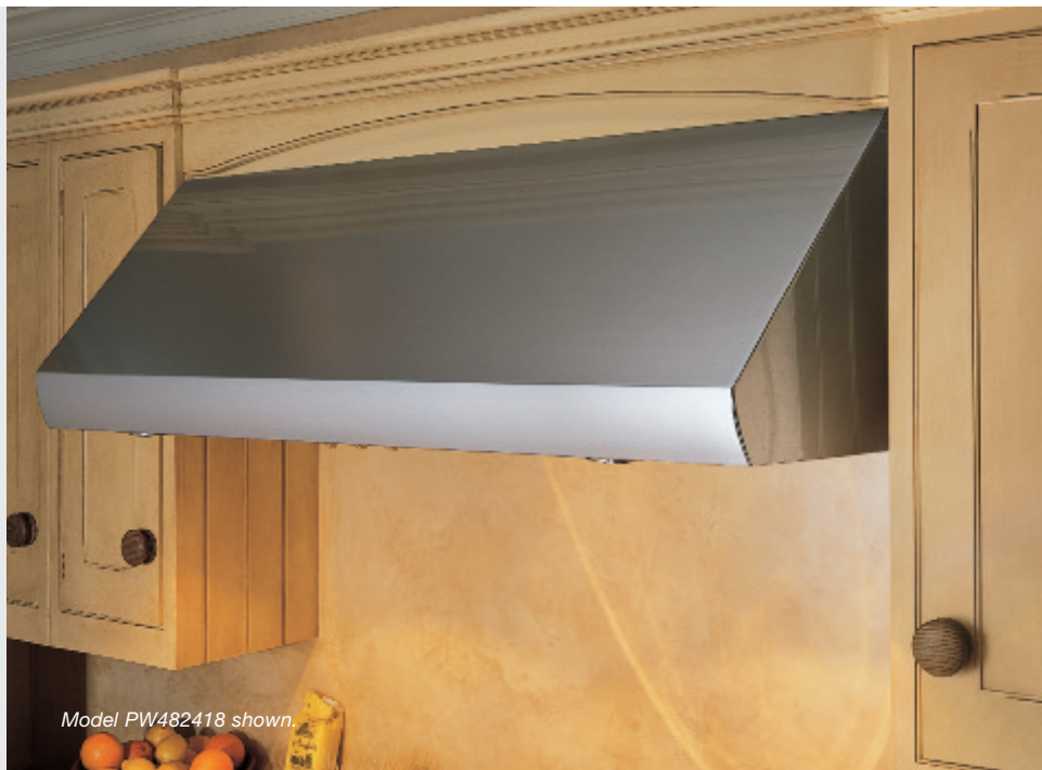
Model PW482418 shown.

With standard features like heat sentry and dual setting halogen lighting, Wolf pro wall hoods provide the ultimate in ventilation. Pro 24" deep wall hoods are available in seven widths.