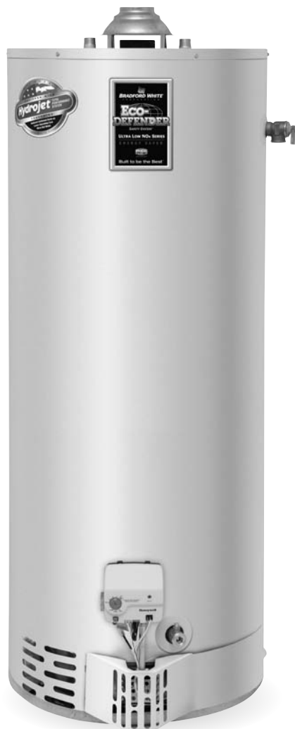
Photo is of U1-5036FRN