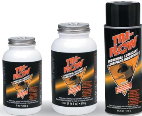
TF23015 9 oz. Jar