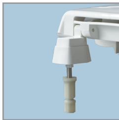
STA-TITE® COMMERCIAL FASTENING SYSTEM™