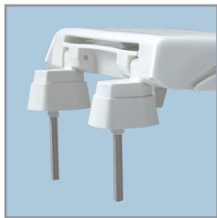
2" LIFT HINGES AND BUMPERS