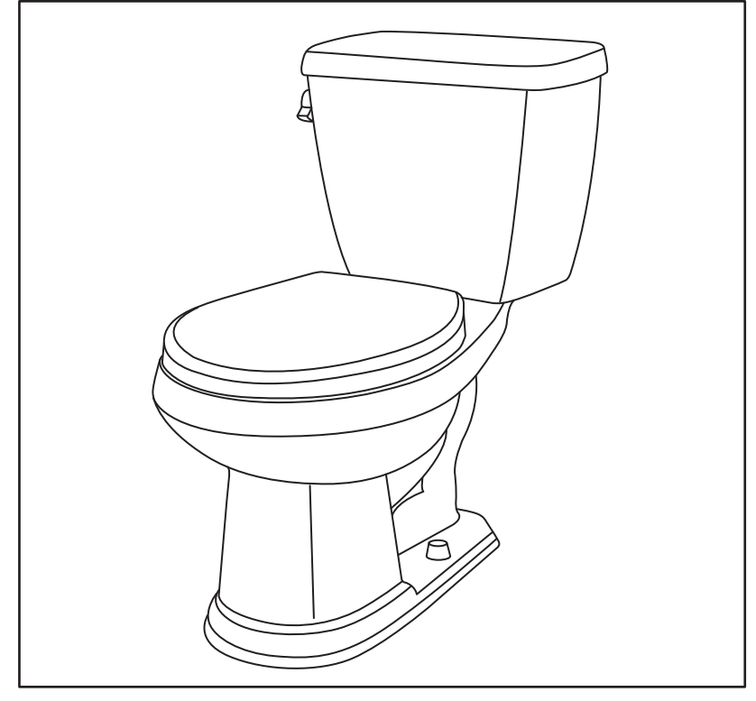
Specifications: Bowl —#21-852 Round Front Seat not included