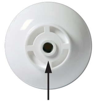
1/4 inch John Guest fittings