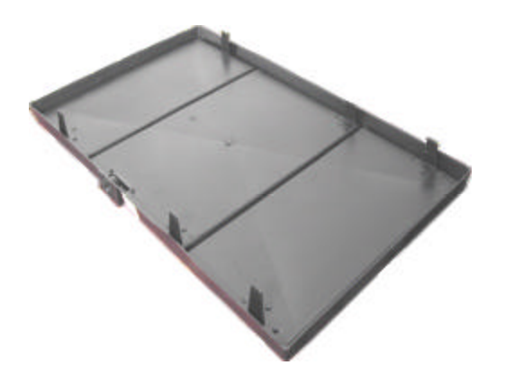
ACCESSORY SAFETY DRAIN PAN