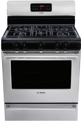
HGS3053UC Stainless Steel