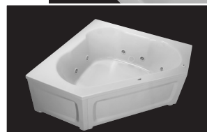
Shown with optional removable apron (PFSK6060)