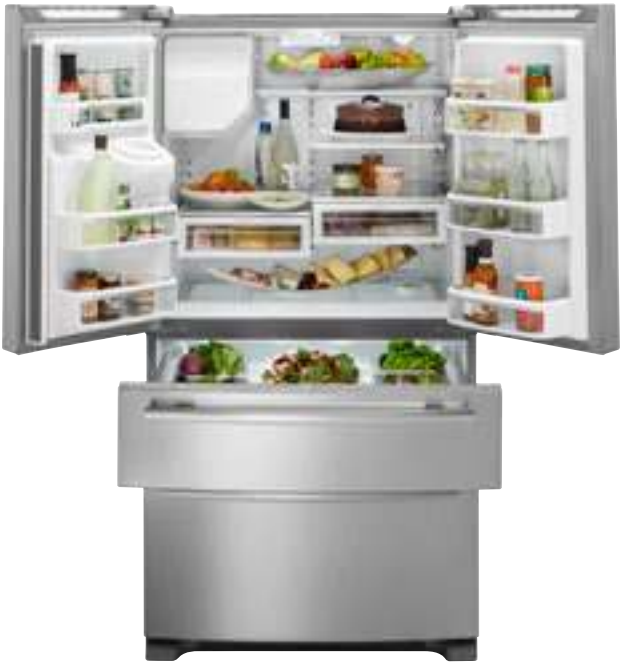
Overall Product Dimensions 35 7 / 8 " w x 69 5 / 8 " h x 33 3 / 4 " d