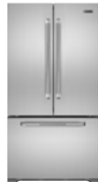
P Pro-Style® Stainless