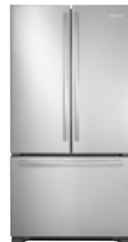
M Euro-Style Stainless