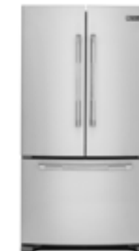
P Pro-Style® Stainless