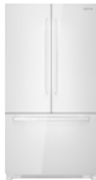
F White Floating Glass