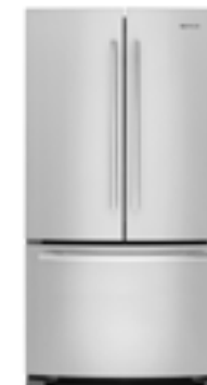
M Euro-Style Stainless