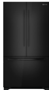
Y Black Floating Glass