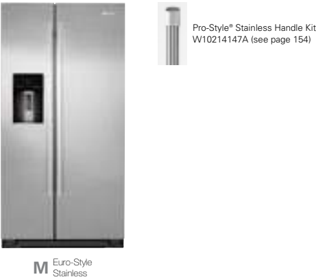
Pro-Style® Stainless Handle Kit W10214147A (see page 154)