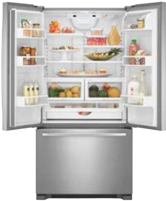
Overall Product Dimensions JFC2290VE – 35 5 / 8 " w x 71 7 / 8 " h x 29 5 / 8 " d † JFC2290VP – 35 5 / 8 " w x 71 7 / 8 " h x 29 7 / 8 " d JFC2290VT – 35 5 / 8 " w x 71 7 / 8 " h x 28 1 / 8 " d ‡