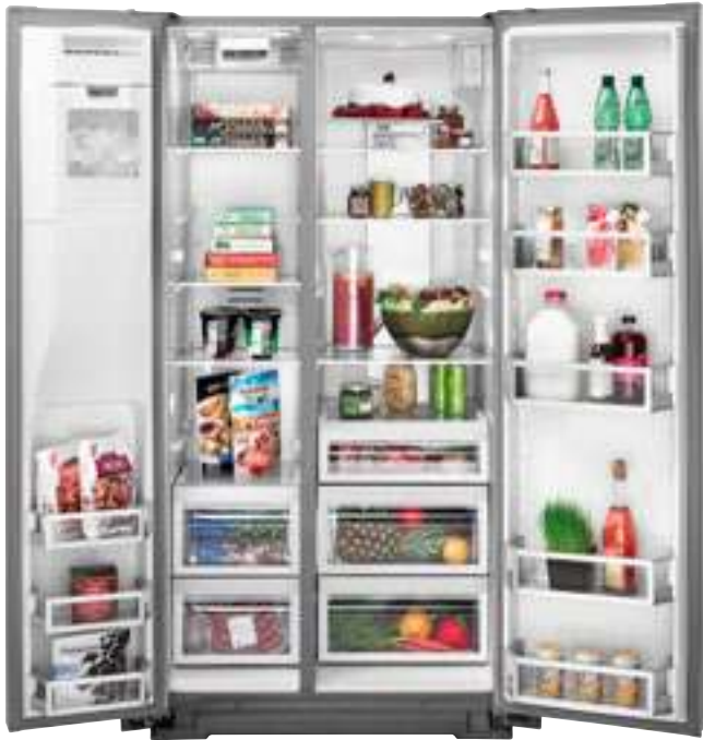
Overall Product Dimensions 35 3 / 4 " w x 71 3 / 8 " h x 29 1 / 2 " d