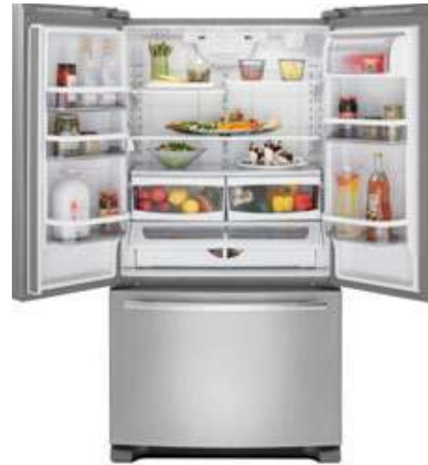
Overall Product Dimensions 35 5 / 8 " w x 70 1 / 8 " h x 29 7 / 8 " d †

* For cabinet color, see page 155. / † For Pro-Style® Stainless model JFC2290VEP, d = 30 1 / 4 ". / ‡ Depth does not include custom panels and handles.