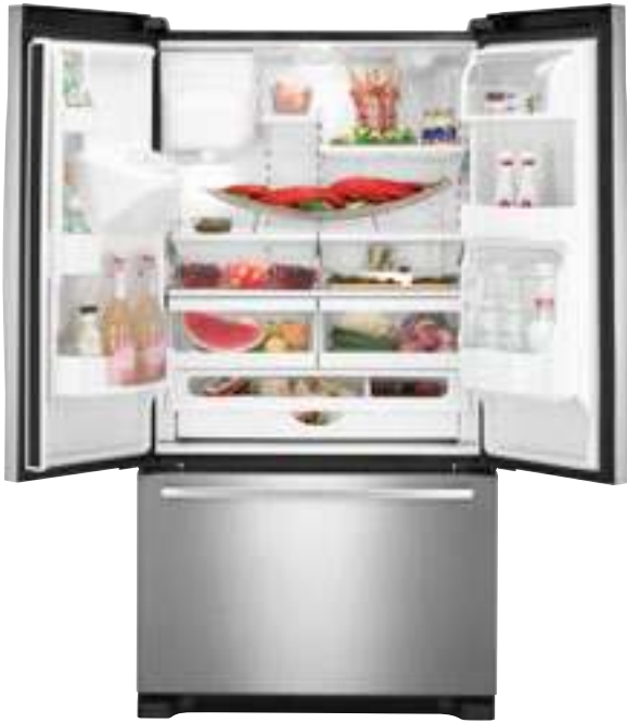
Overall Product Dimensions JFI2089AE – 35 5 / 8 " w x 70" h x 29 3 / 8 " d JFI2089WE – 35 5 / 8 " w x 70" h x 28 3 / 4 " d JFI2089WT – 36" w x 70" h x 28 3 / 4 " d