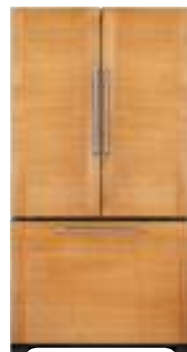
B Custom Panels and Handles