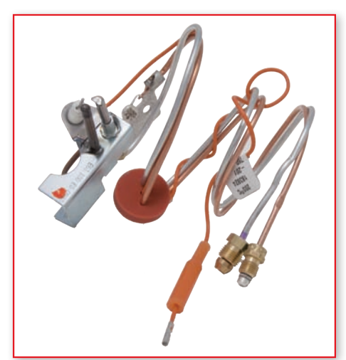
Fig. 1 Fig. 2 Fig. 3