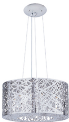
E21309-10PC Inca 7-Light Pendant