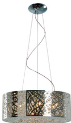
E21308-10PC Inca 9-Light Pendant