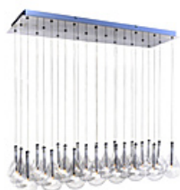
E20118-18 Larmes 24-Light Pendant