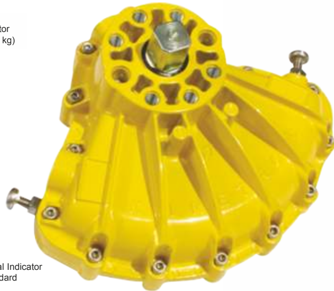
Visual Indicator Standard