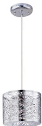
E21306-10PC Inca 1-Light Pendant