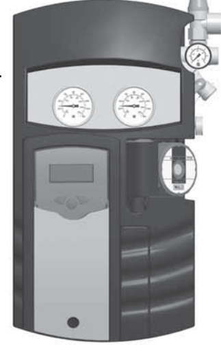
Standard Pump Station