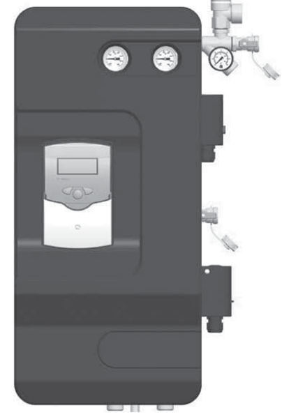
Double Wall Pump Station