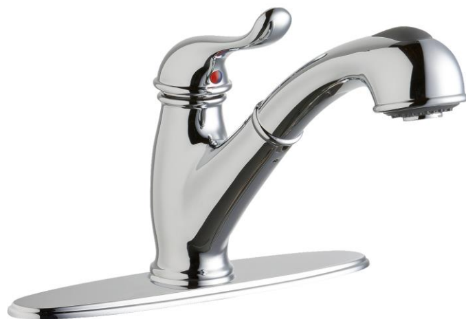
Lustrous Steel (LS)