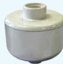
AQ-2125 replacement cartridge

Model: AQ-2100 Replacement filter: AQ-2125 Rated service flow: 2.5 gpm Max working pressure: 20-100 psi Max capacity: 10,000 gal