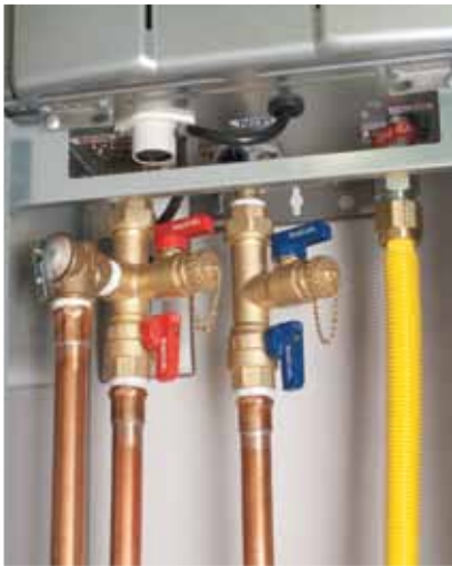
Compact design ideal for cover and recessed box installations