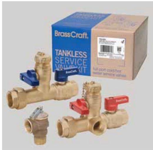
NEW! PACKAGING: Significantly smaller and conveniently sized to reduce jobsite waste