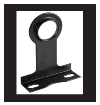
EXTENDED PIPE STAY

• Size range: 1/2"- 1 1/4" copper to 3/8"- 1" iron pipe