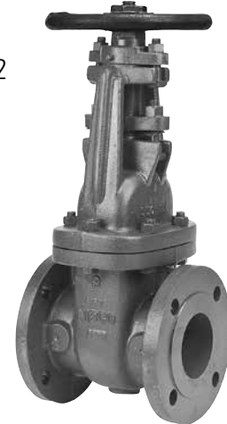
F-637-33 Flanged-Raised Face