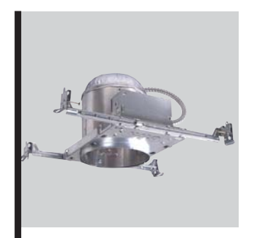
H7ICT 6" Insulated Ceiling Recessed Housing