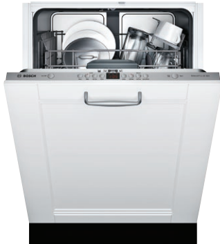
SHV53T53UC Panel Ready

Bosch dishwashers are so quiet, you may forget they're on. InfoLight® projects a red light onto the floor to let you know it's on.