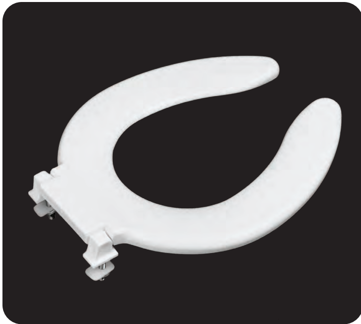
523 Elongated (Open front seat less cover)

Seat Shall be Beneke No. • 423 Regular • 523 Elongated