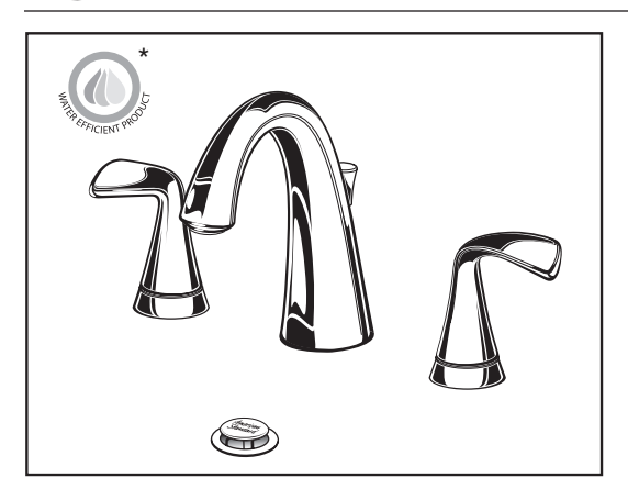
*WaterSense® approval pending