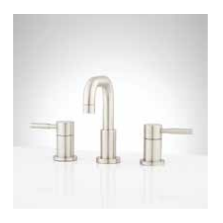
PAGE 2 CODE: SHWSCED800BN, SHWSCED800CP