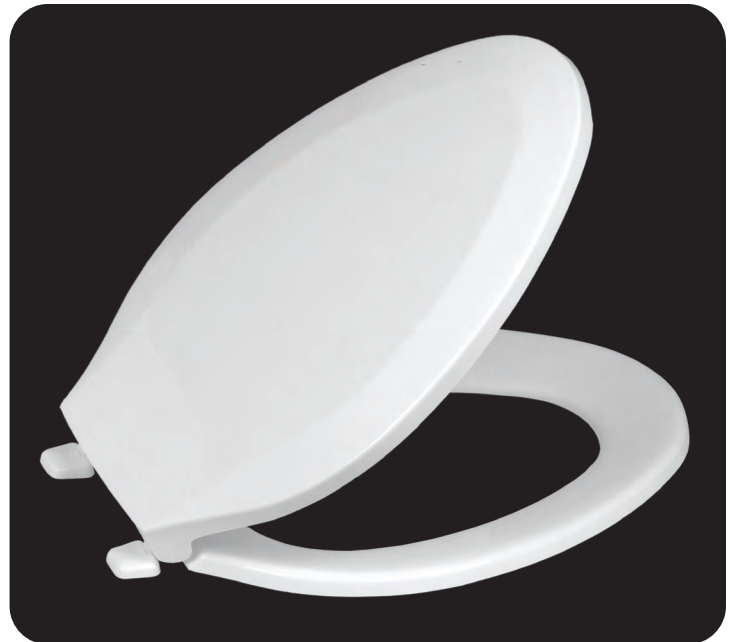
500 TM Elongated (Closed front seat with cover)