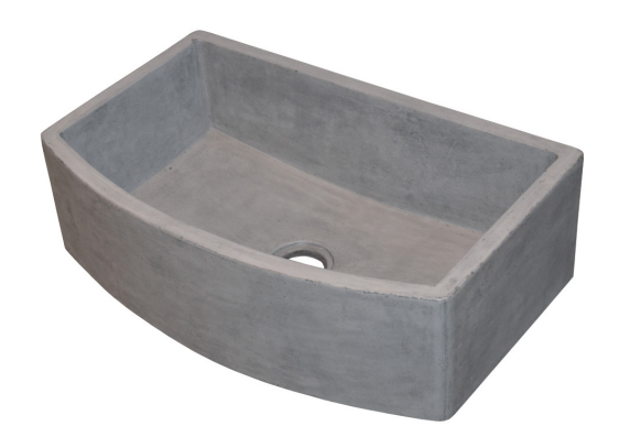
NSKQ3320-A Ash NSKQ3320-S Slate NSKQ3320-P Pearl