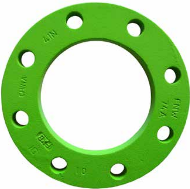
Figure Number Matrix