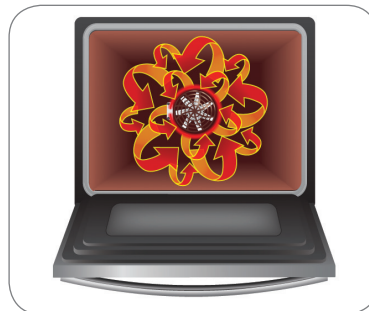
True Convection Oven