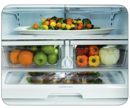
CoolSelect Pantry™ with Temperature Control