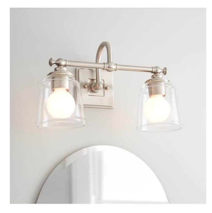
CODES/STANDARDS UL 1598 / CSA C22.2 No 250.0